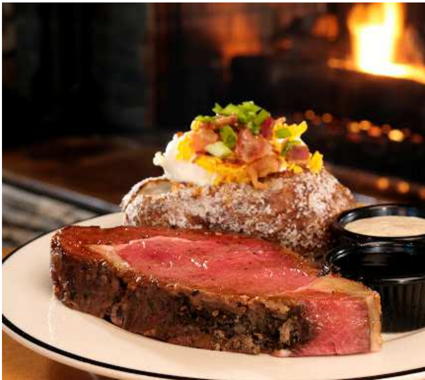
Saturday Chef's Plate This weeks feature: Halibut