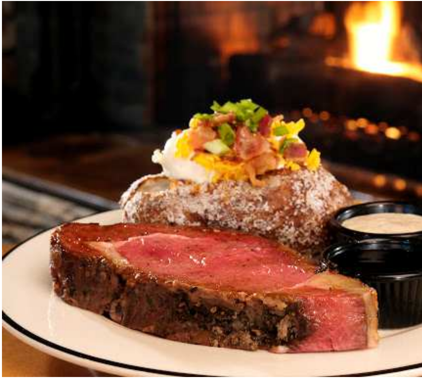
Saturday Chef's Plate This weeks feature: Halibut