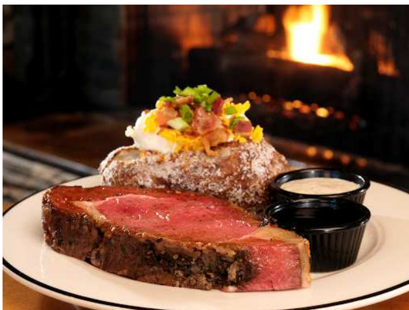
Saturday Night- Halibut Feature